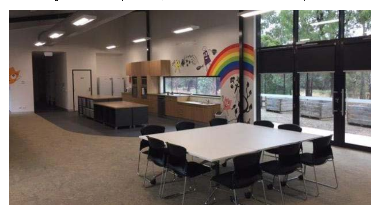
Figure 3 Inside the BCHS Kidzspace building

Aggregated data on clients coming to the HJP, referrals to and from the HJP and numbers of LSCs are detailed, as well as aggregated data from the quantitative and qualitative tools and a discussion of the issues, trends comparison and their significance in Chapters Nine, Ten and Eleven of the Full Final Report.